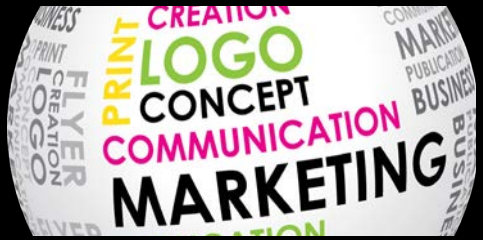
BRAND POSITIONING & MARKETING