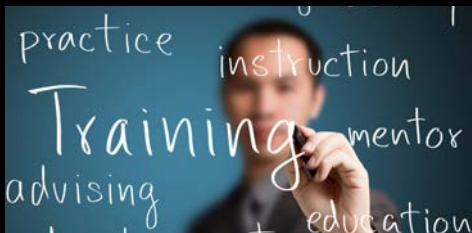
PROFESSIONAL DEVELOPMENT & TRAINING