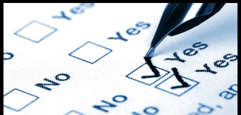
STUDENT LIFECYCLE SURVEYS