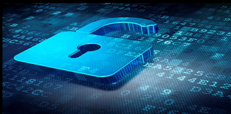
DATA MANAGEMENT & WAREHOUSING

Our expertise in strategic planning, research and evaluation, institutional auditing, branding and market analysis, and predictive analytics allows us to bring forth a comprehensive set of solutions to help you and your institutional team plan and execute a student success system. Working with SwailLandis experts allows your institution to utilize cutting-edge solutions for your institutional needs.